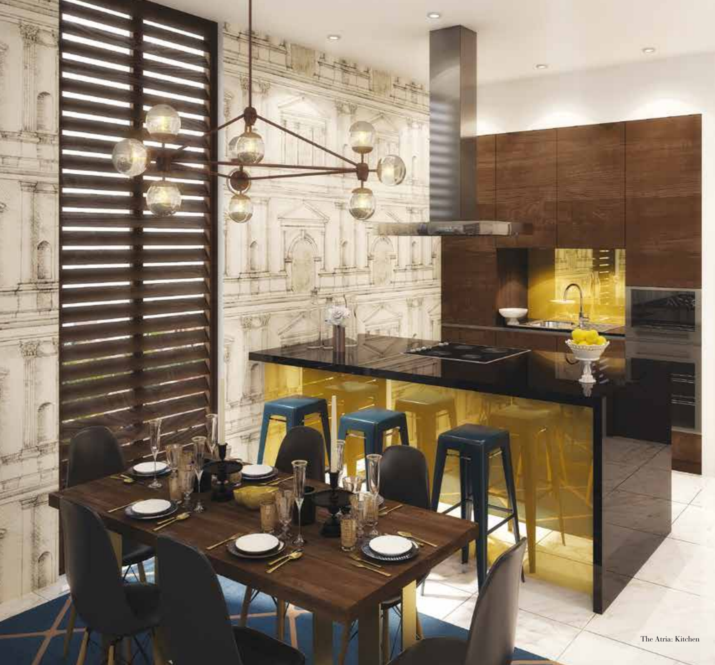
The Atria: Kitchen