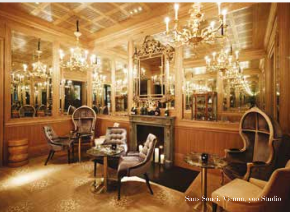
Sans Souci, Vienna, yoo Studio