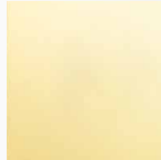
Champagne coloured mirror for back splash and large full height mirrors