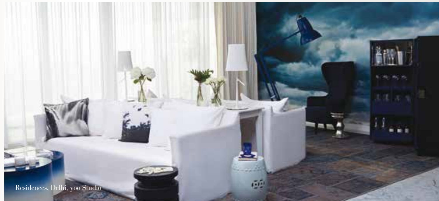
Residences, Delhi, yoo Studio