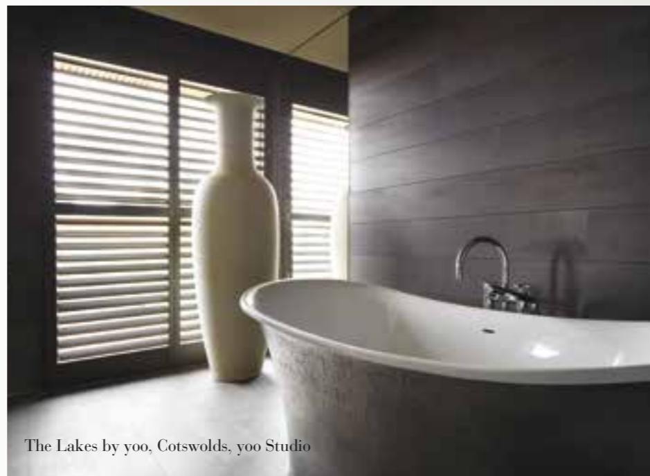
The Lakes by yoo, Cotswolds, yoo Studio