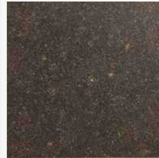
Porcelain tiles in black for bathroom borders and maid's room floor