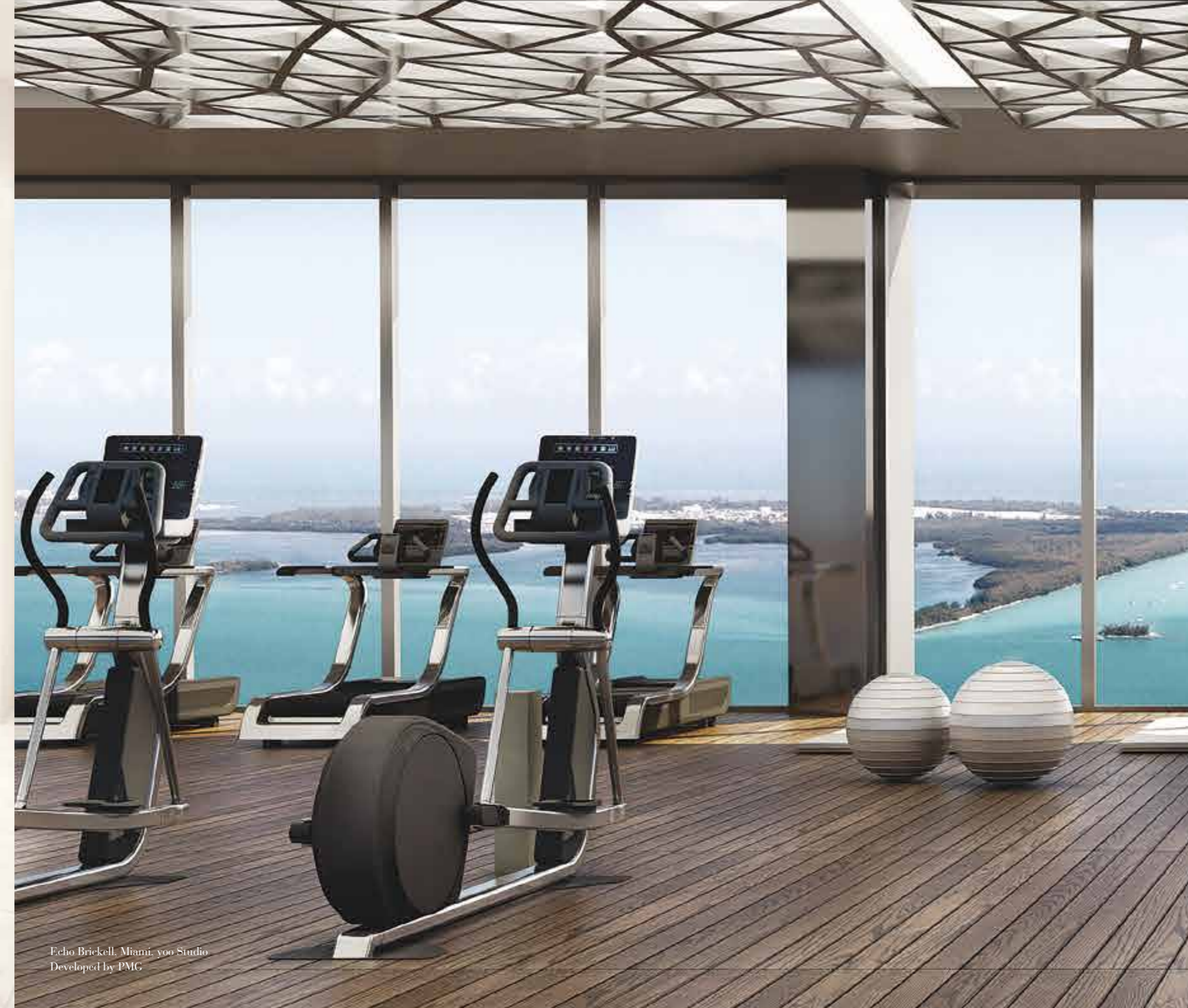
Echo Brickell, Miami, yoo Studio Developed by PMC