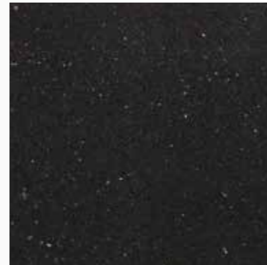
Black silestone for kitchen work surface