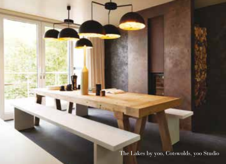
The Lakes by yoo, Cotswolds, yoo Studio