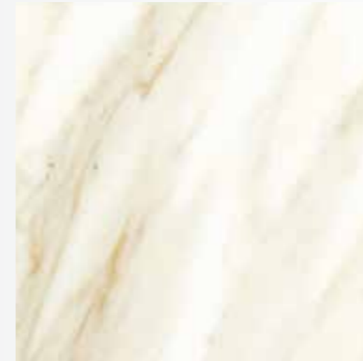
Calacatta porcelain marble effect tile for bathrooms and living room

At The Atria, you have the luxury to choose from a range of Furnishing, Bathroom and Kitchen finishes, carefully selected by the yoo Studio. It's all about you.