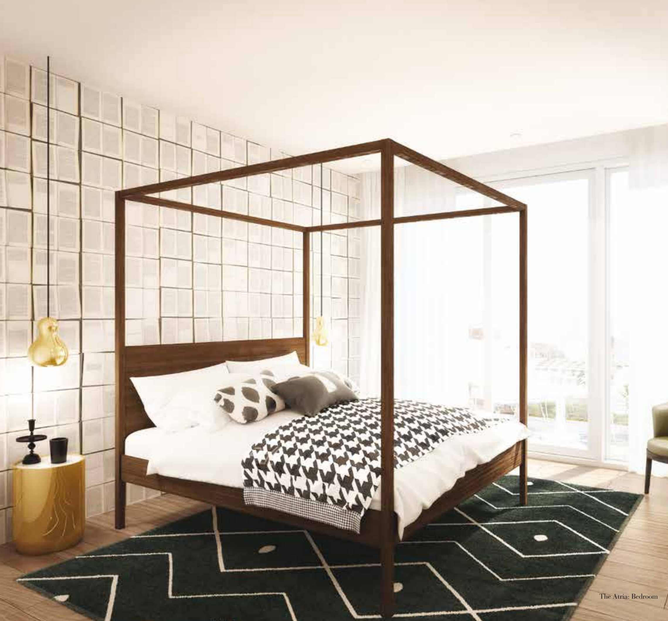
The Atria: Bedroom