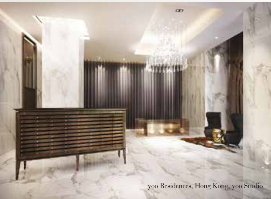
yoo Residences, Hong Kong, yoo Studio