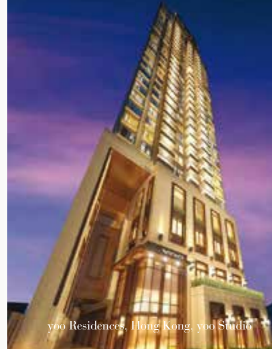
yoo Residences, Hong Kong, yoo Studio