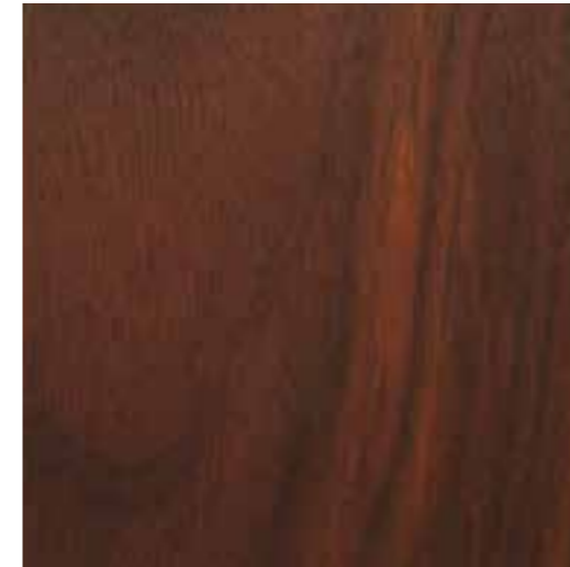
Furniture and doors in black american walnut