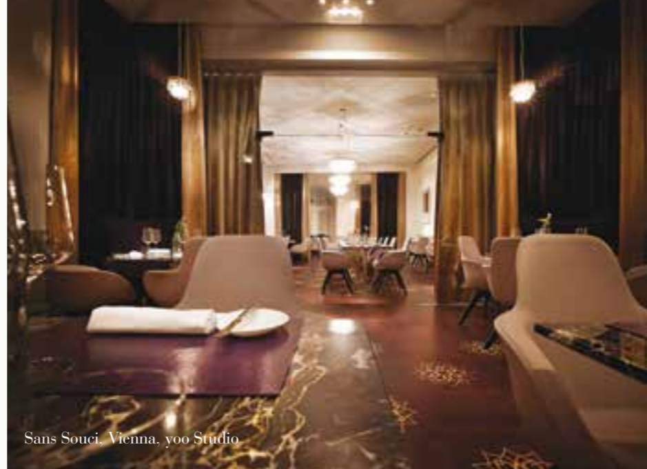
Sans Souci, Vienna, yoo Studio