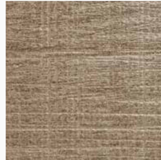
Porcelain wood effect tile