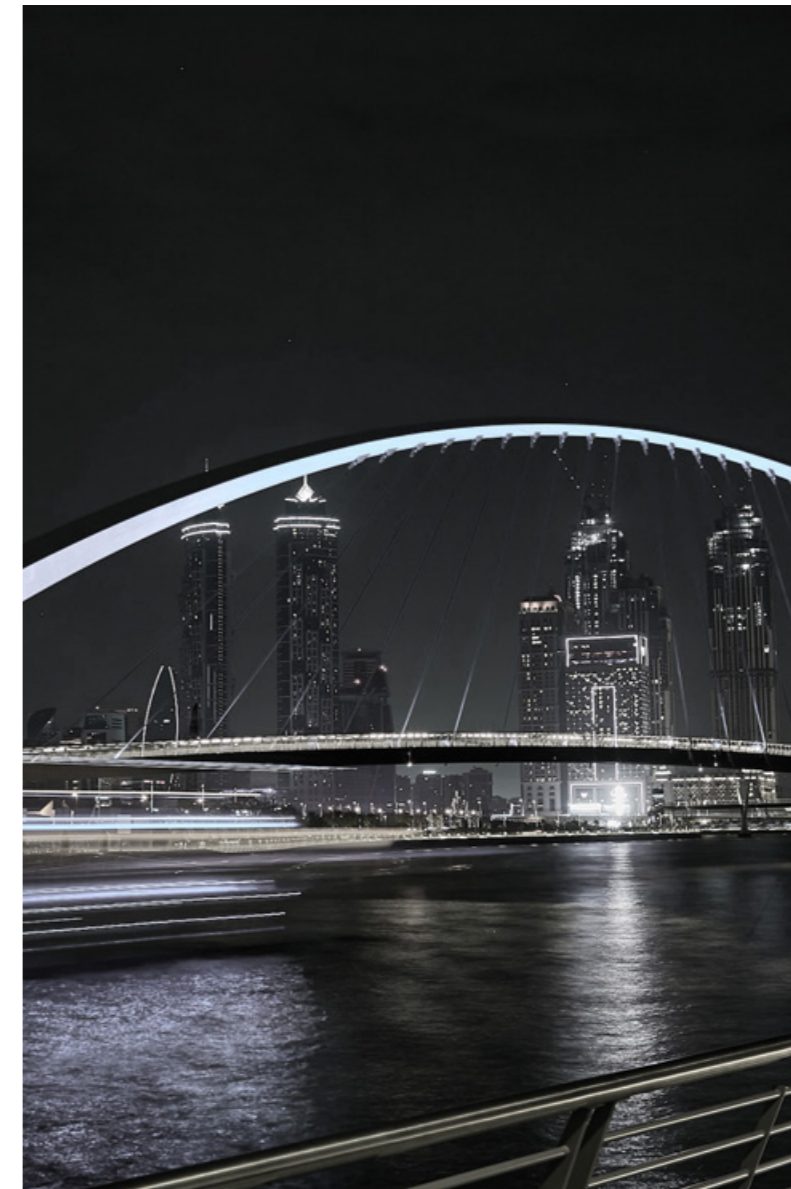
CANALSIDE COSMOPOLITAN WITH DUBAI WATER CANAL VIEWS

With its canalside spaces, collection of fitness amenities, and, of course, close connection to Downtown Dubai, residents of One River Point take full advantage of Dubai's wealth of opportunities.