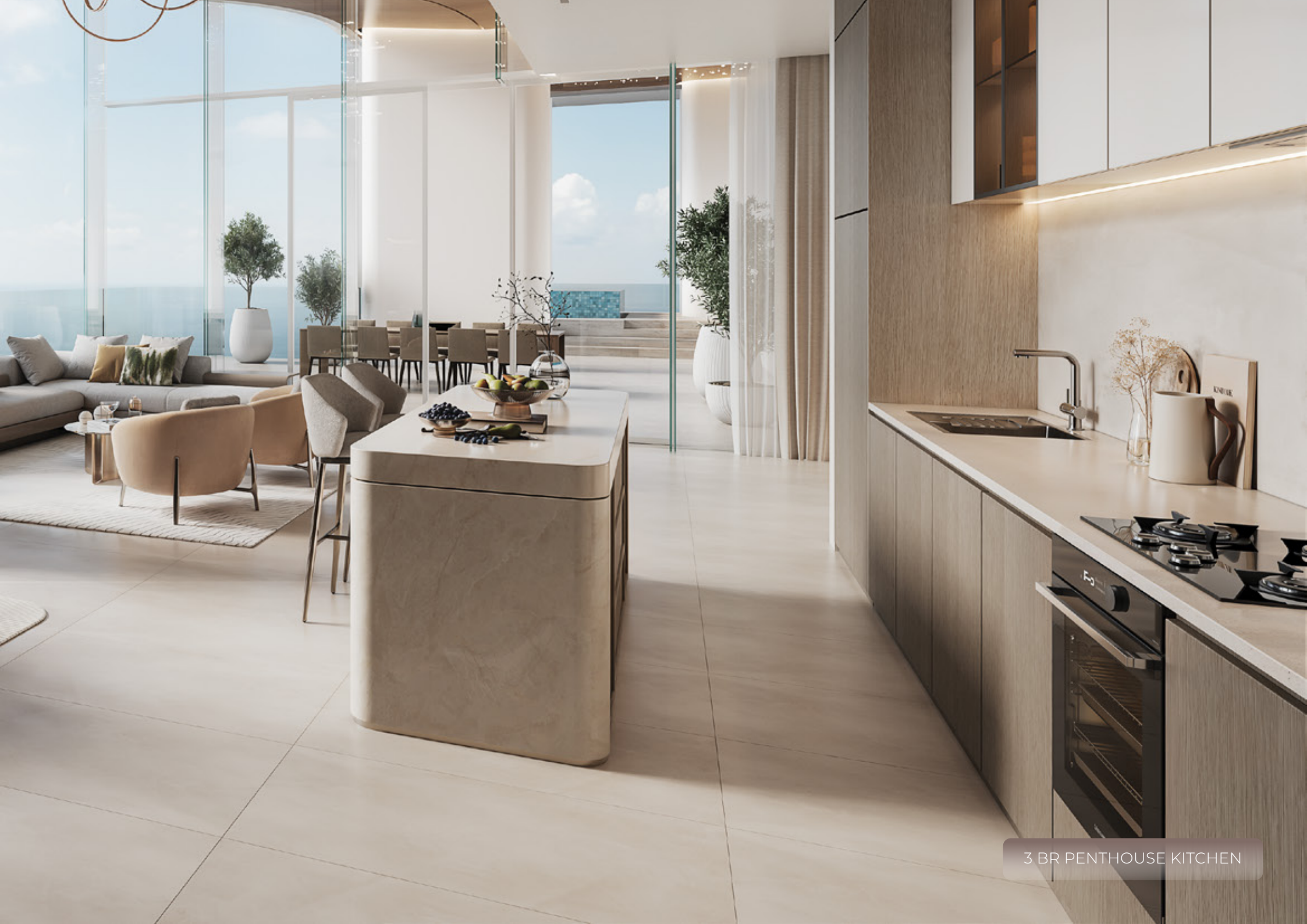
3 BR PENTHOUSE KITCHEN