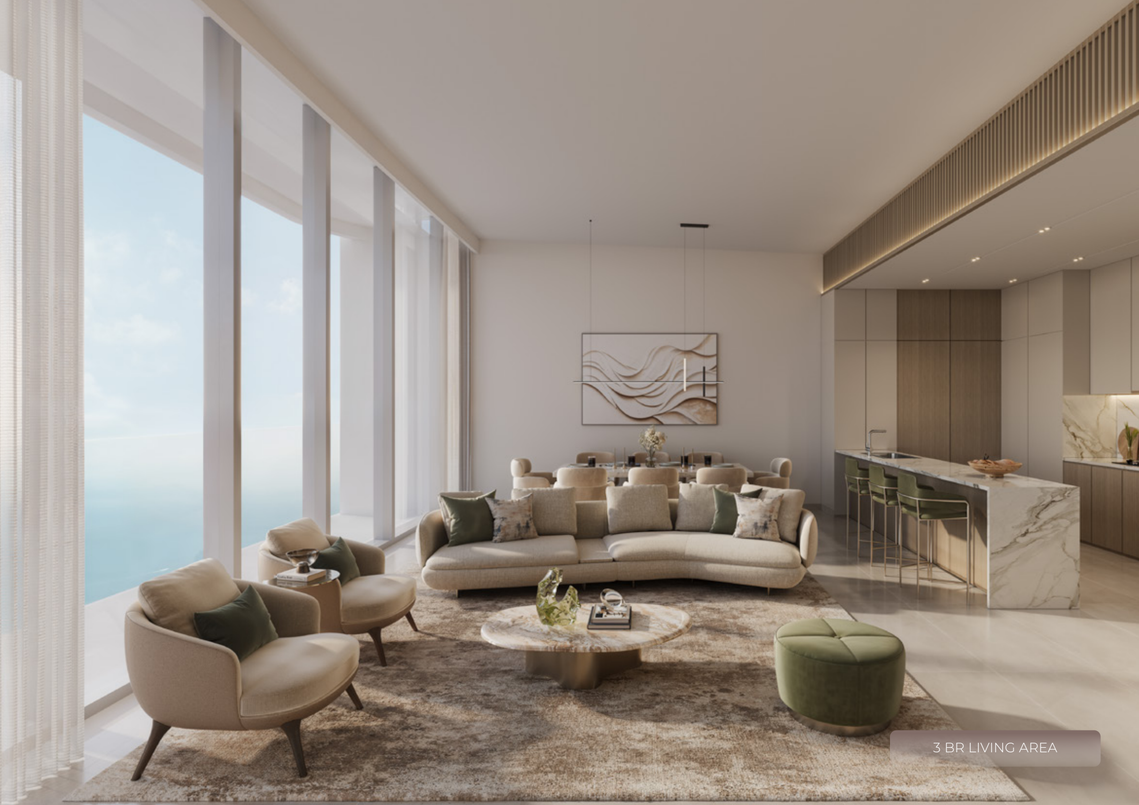
3 BR LIVING AREA