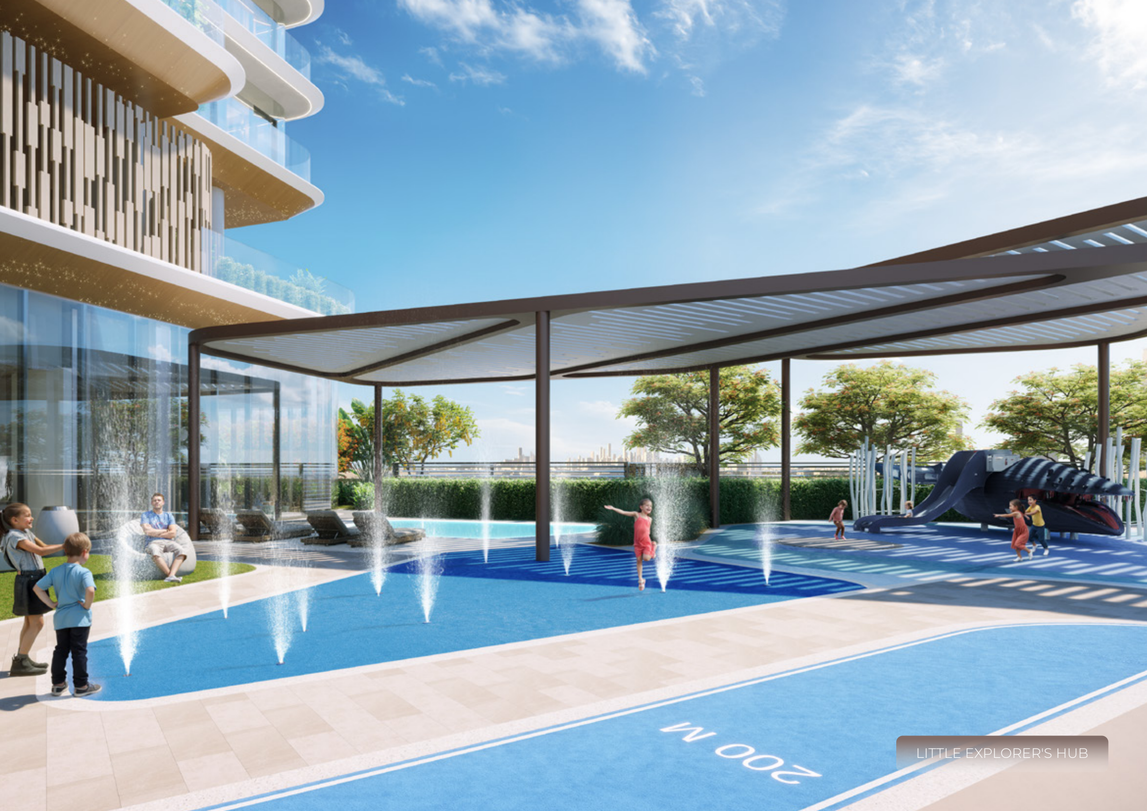
LITTLE EXPLORER'S HUB