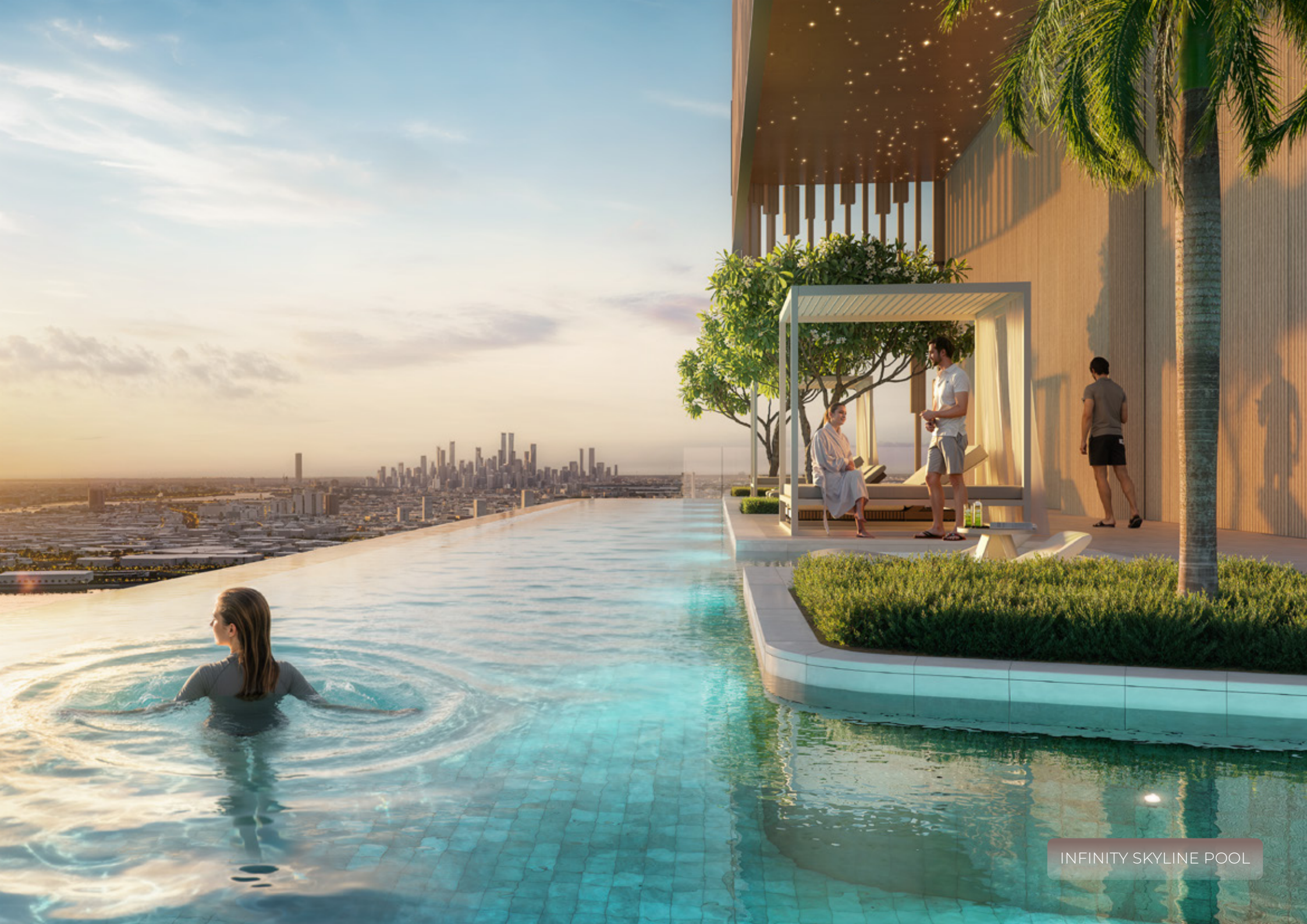
INFINITY SKYLINE POOL