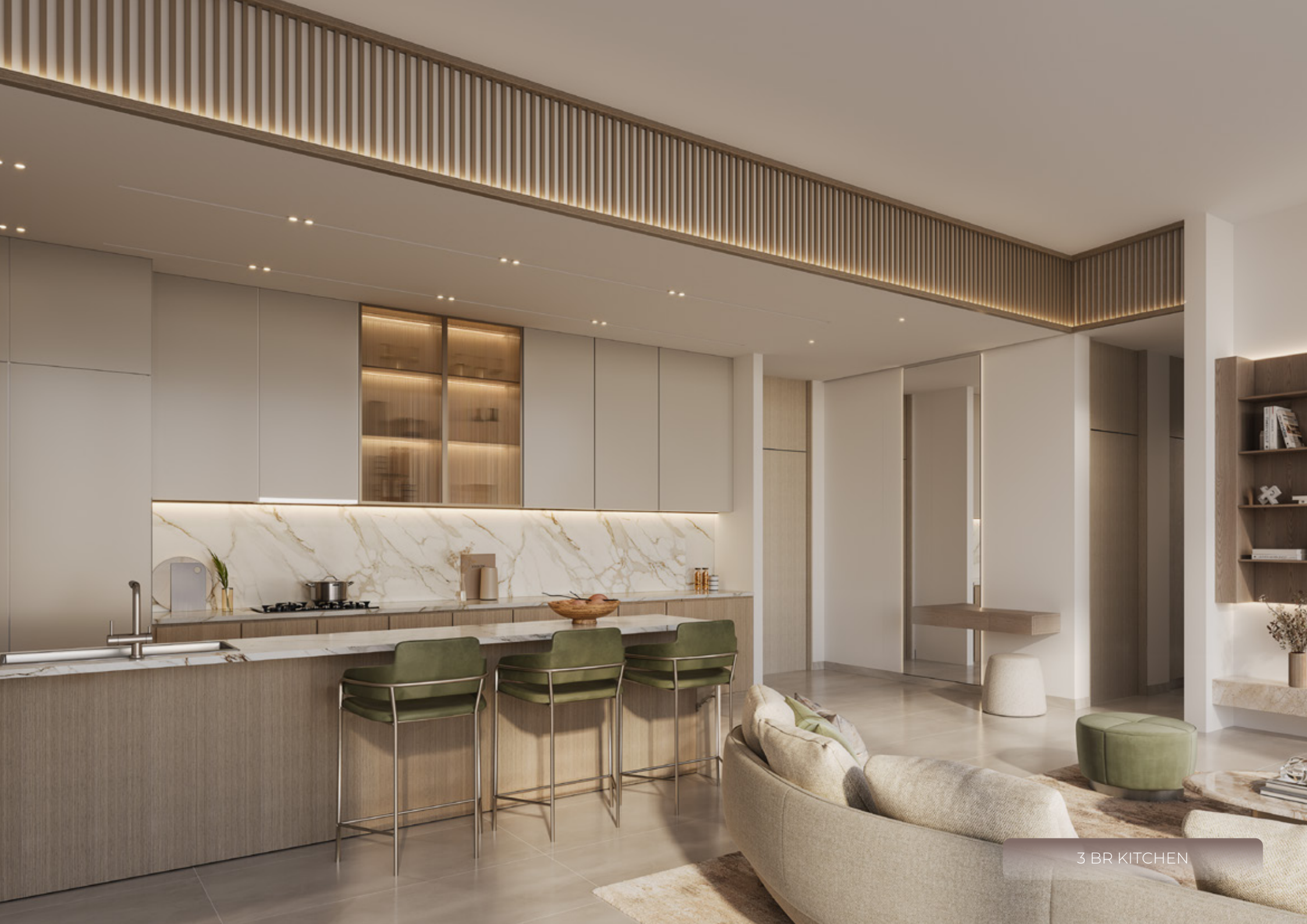
3 BR KITCHEN