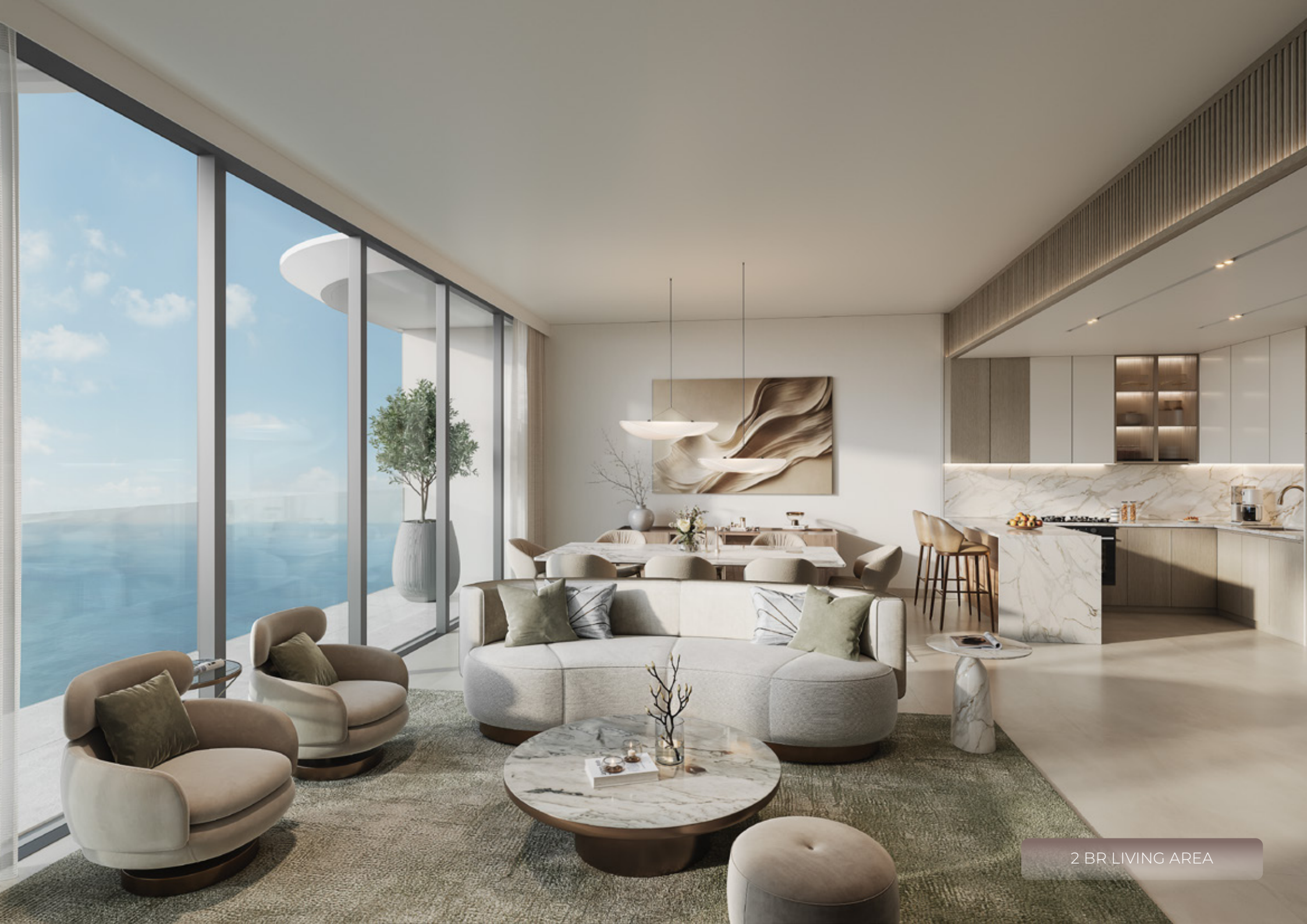
2 BR LIVING AREA