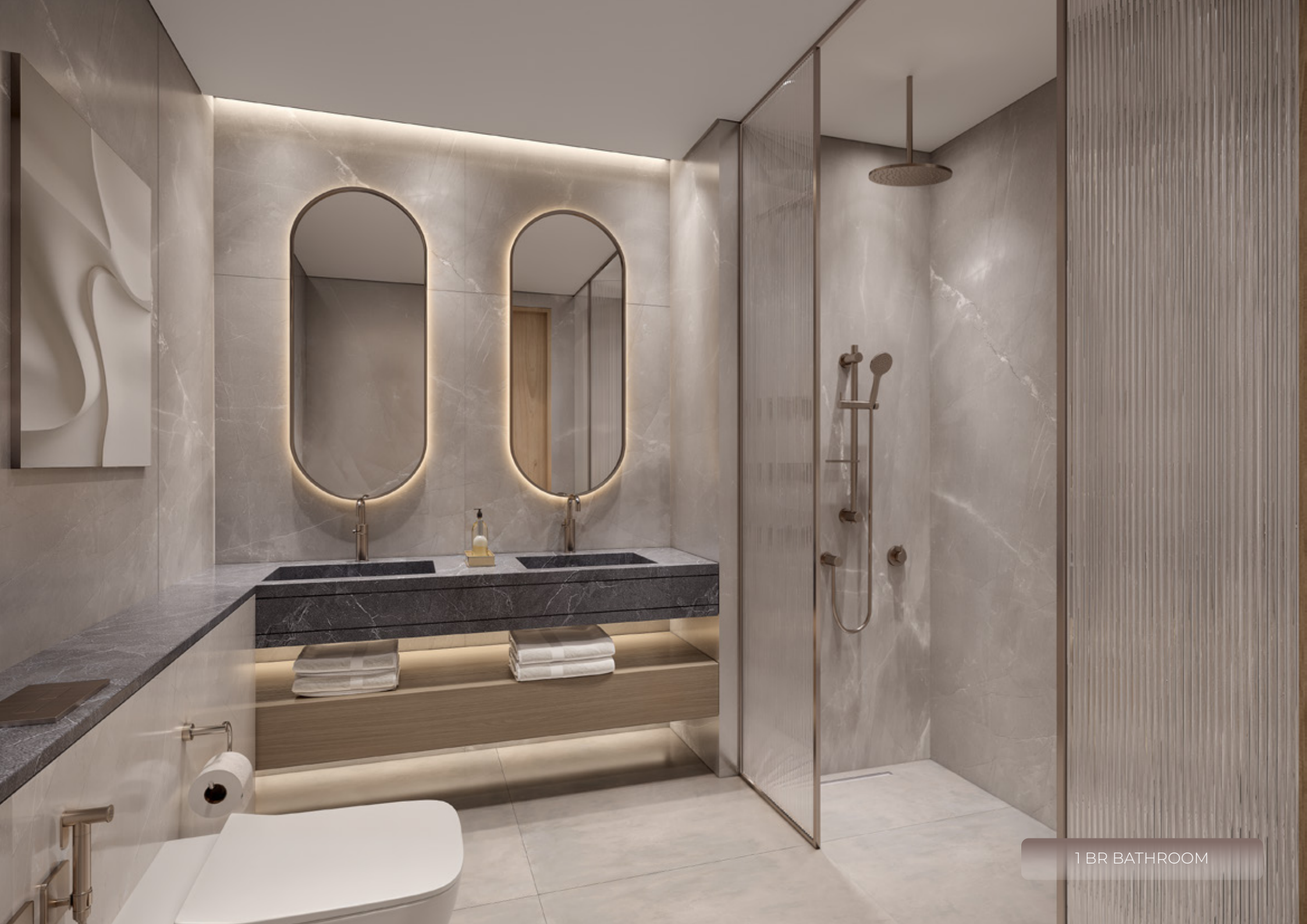
1 BR BATHROOM